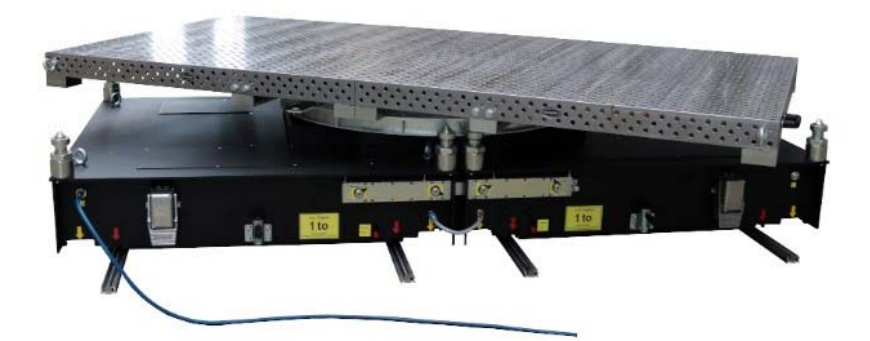
Caption 1: Trolley with manual rotating platform for high-precision feeding of a laser welding cell

The intra-logistics specialist LOSYCO has expanded its LOXrail system, adding a new automatic trolley with a rotating loading platform for flexible orientation of heavy workpieces directly on rails. This solution, which has already been successfully implemented in a machine factory, increases flexibility in assembly line layouts and simplifies the adaptation of the rail transport system to existing production lines and floor plans. The new trolley can be realized in different dimensions according to customer requirements. It enables manual or motordriven rotation and orientation of payloads up to 10 tons. Application areas include laser and robot welding cells, measuring machines, feeding systems and other production systems requiring highly precise positioning and easy access to workpieces. The turntables can be powered via drives installed at the respective work stations or onboard drives fed via cable, energy guiding chain, battery or induction. LOSYCO is thus expanding its adaptable range of LOXrail-based transport systems for production logistics, material flow and machine loading and unloading, which ranges from manually moved trolleys to shuttles and transport platforms with sensor-controlled automatic braking to versions with mechanical or semi-automatic steering.